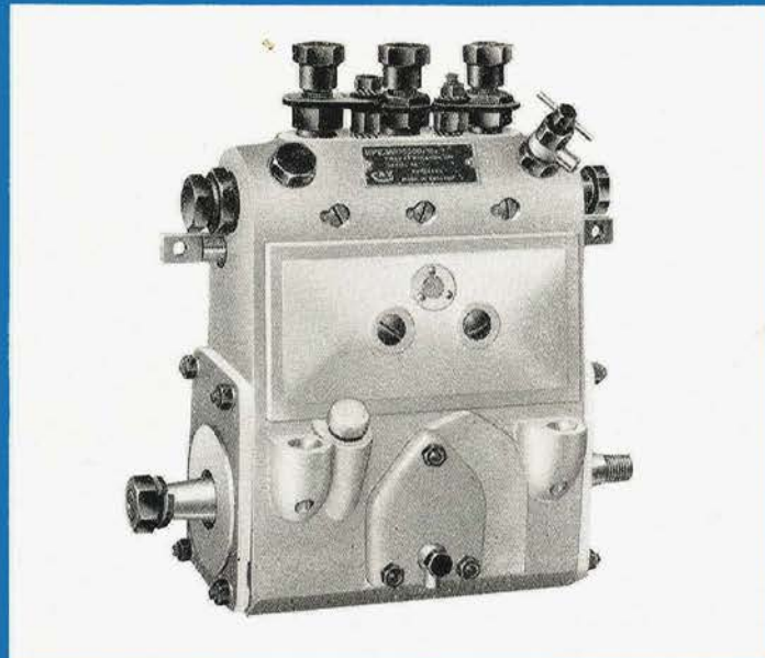
BPE 1, 2, 3, 5 & 8B FUEL PUMPS